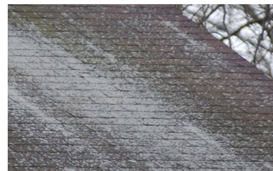
Algae & Moss Growth